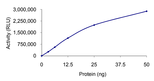
Figure 3. ADP- Glo™ Assay Data

The specific activity of AMPK was determined to be 1100 nmol /min/mg as per activity assay protocol. (For ADP-Glo™ Assay Protocol on this product please see pg. 3)