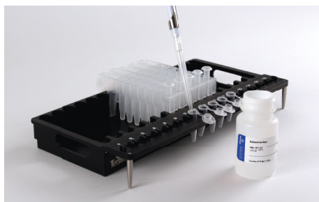
Figure 2. Setup and configuration of the deck tray. Elution Buffer is added to the elution tubes as shown. Plungers are in well #8 of the cartridge.